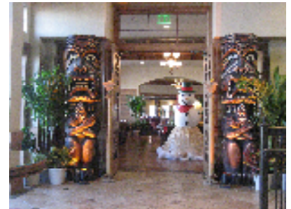
Jennifer Trent's Winter Luau themed event at Sawgrass Marriott

The XLC is relatively compact, as was designed to meet the challenges of difficult acoustical environments, such as sports facilities and performing arts venues where a traditional line array might be too large. The new design performs extremely well in areas of pattern control and predictability, providing echo-free, clear sound for large crowds. Sight & Sound Productions can now outfit audio for large concerts and unconventional venues; combined with dramatic lighting and video, events can be taken to a whole new level.