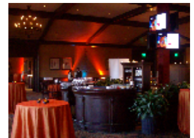
Jacksonville Business Journal's 2009 Book of Lists Party at TPC Clubhouse